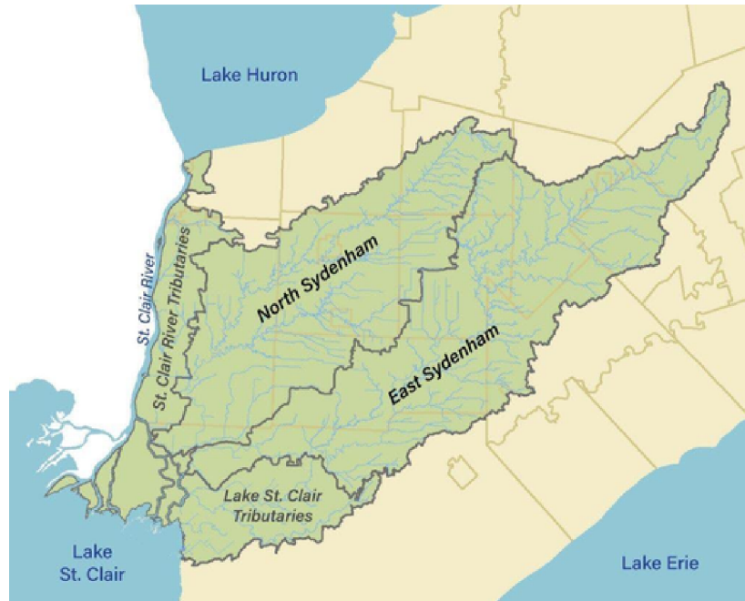
Figure 1. Map of North and East branches of the Sydenham River.