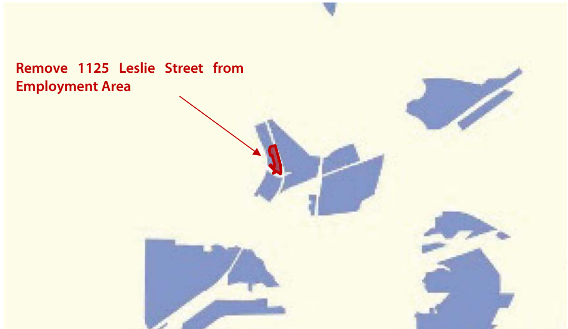
Figure 5 – Removal of Subject Lands From Employment Area as shown on excerpt from OPA 591, Appendix 1: Map 2