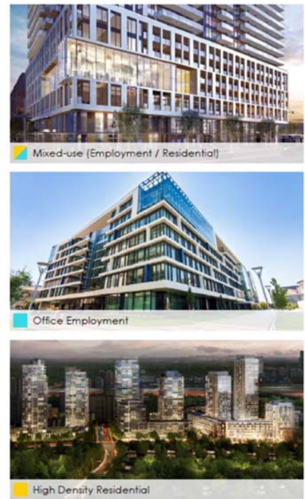
Figure 2 – Redevelopment Demonstration Plan

On July 22, 2022 City of Toronto Council adopted OPA 591. While OPA 591 modified the parent Official Plan and responded to conversion requests, it did not deal specifically with the request to convert the Subject Lands. Our client sees this as a significant failure by the City to recognize the redevelopment potential of these underutilized which would provide significant amounts of housing as well as employment opportunities in a rejuvenated and revitalized urban format.