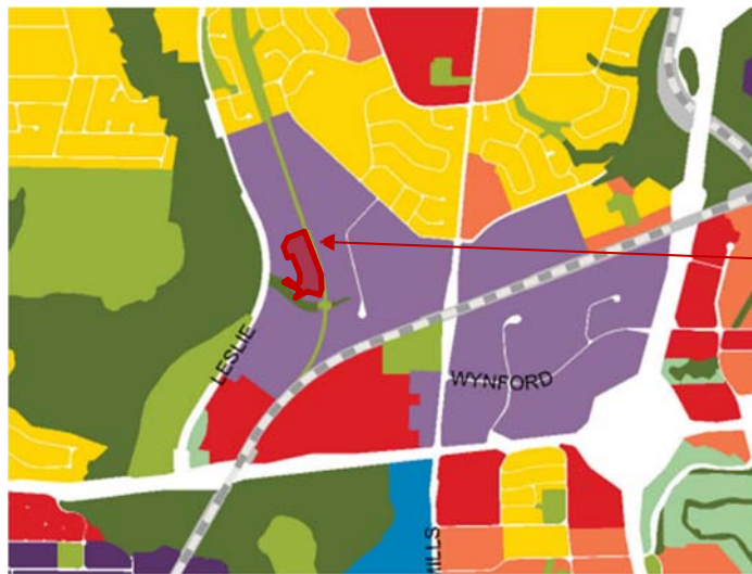
Figure 6 – Designate Subject Lands from General Employment Area to Mixed Use Areas as shown on excerpt from Official Plan Land Use Designation Map 20 (Tile Map 21 of OPA 591, Appendix 2)