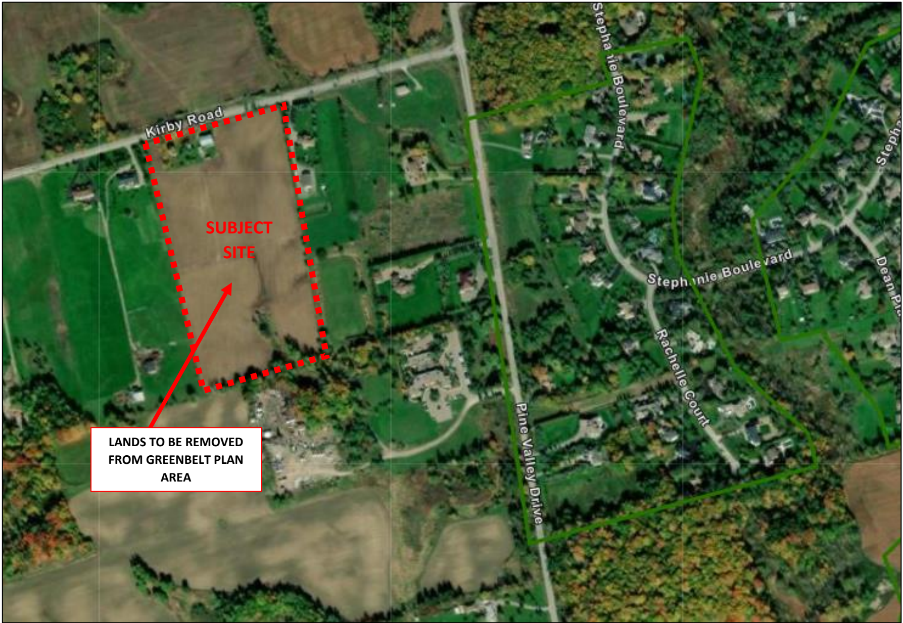
Attachment 4: Proposed Amendment to the Greenbelt Plan Area Boundary