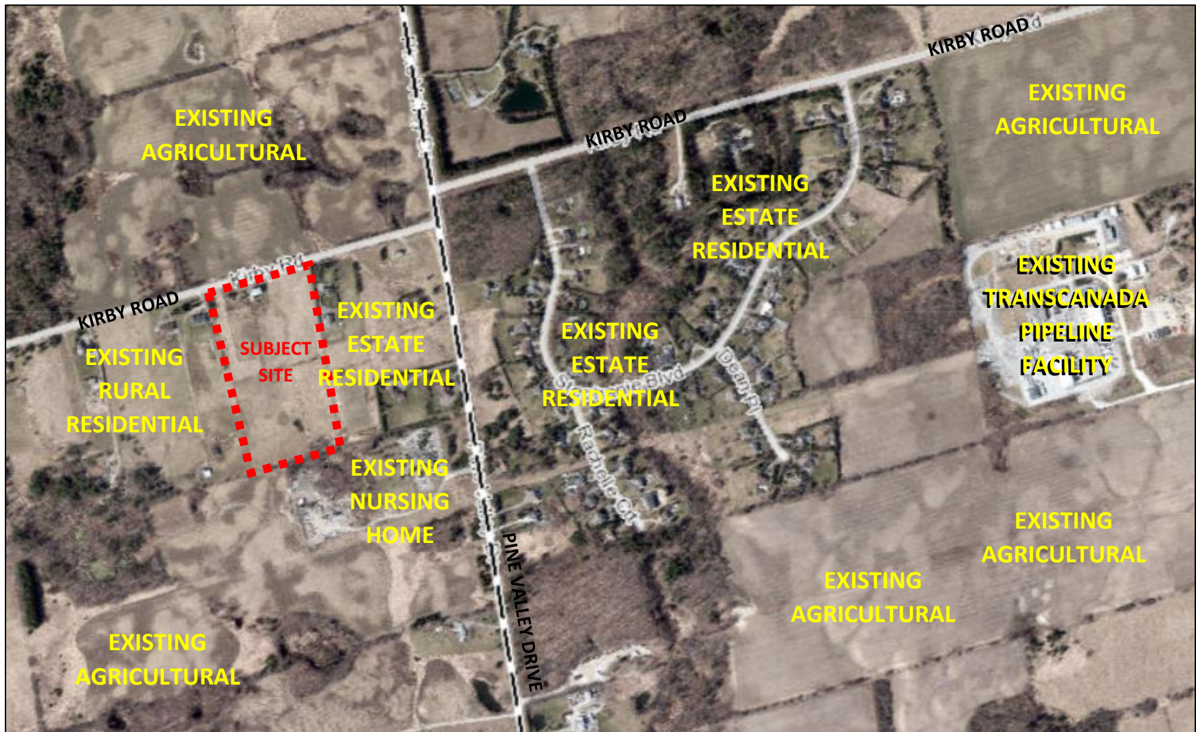
Attachment 2: Site Context