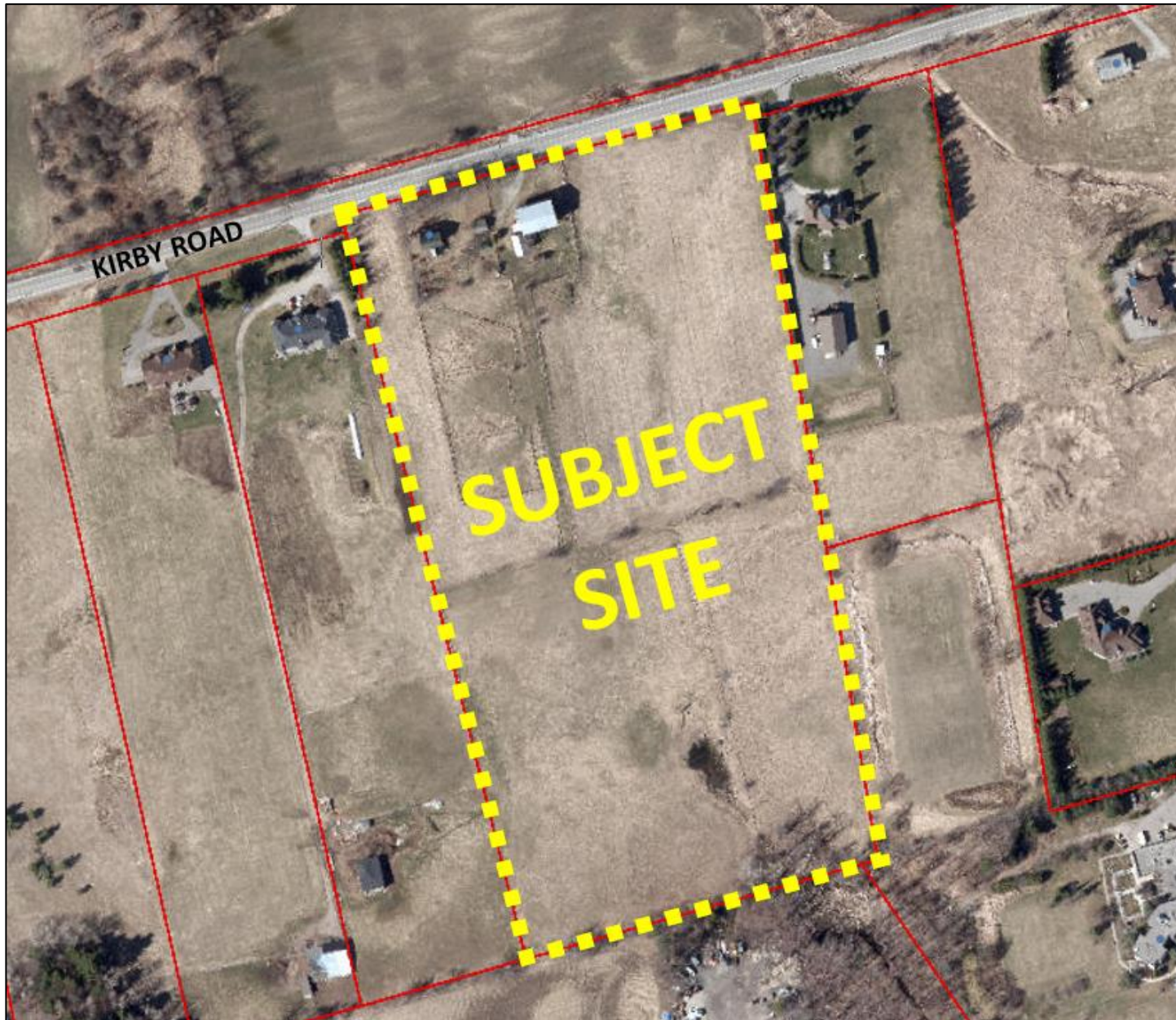
Attachment 1: Aerial View of Subject Site