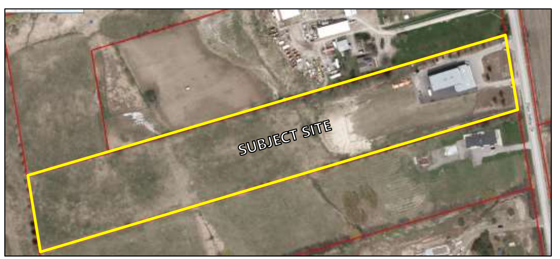
Aerial Photo Lands owned by the Applicant

Pine Valley (Mosaik) Inc. is the owner of a 4ha property addressed as 10930 Pine Valley Drive and legally described as Part of Lot 27, Concession 7 in City of Vaughan. The property is located on the west side of Pine Valley Drive just north of Teston Road as illustrated below.