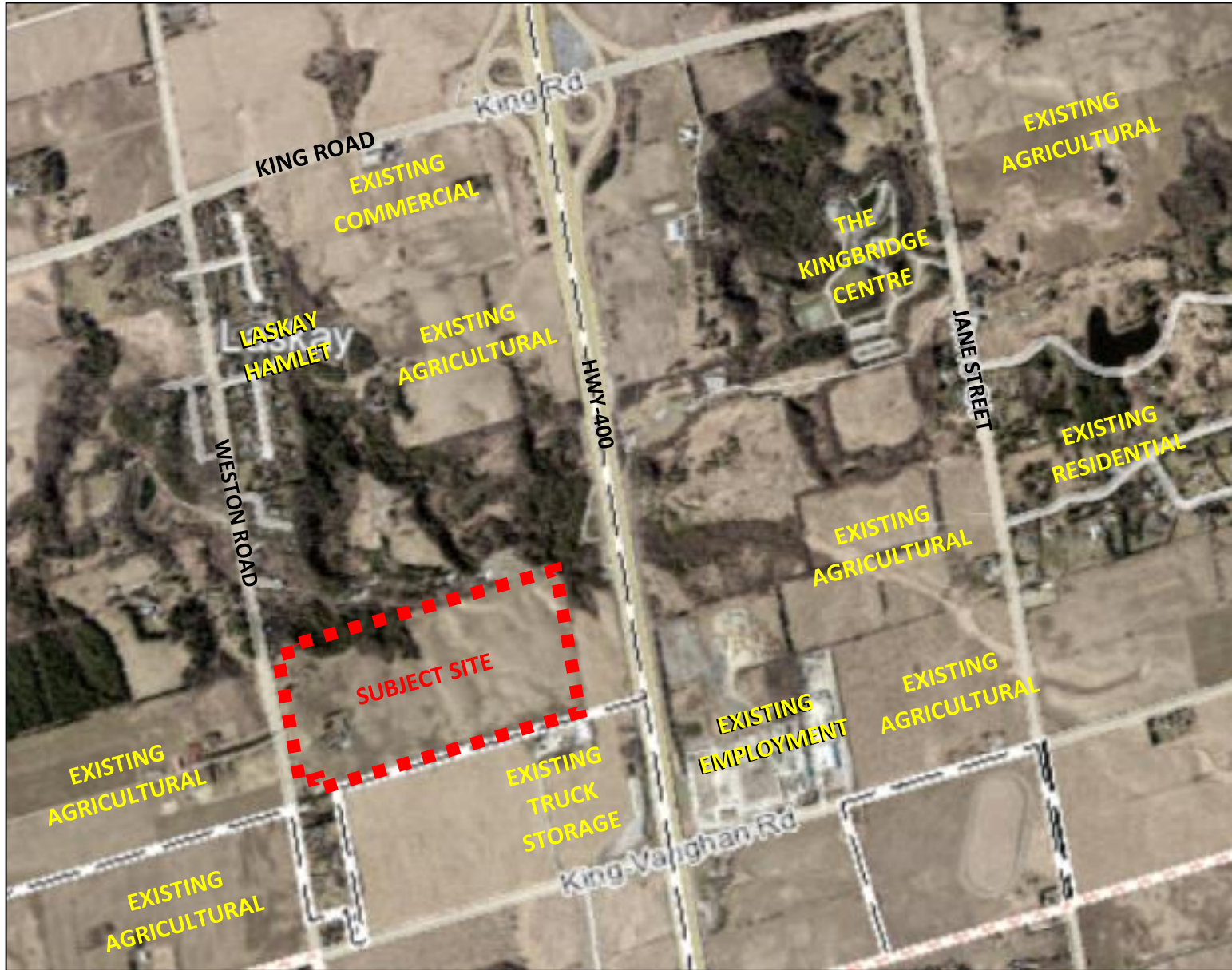
Attachment 2: Site Context