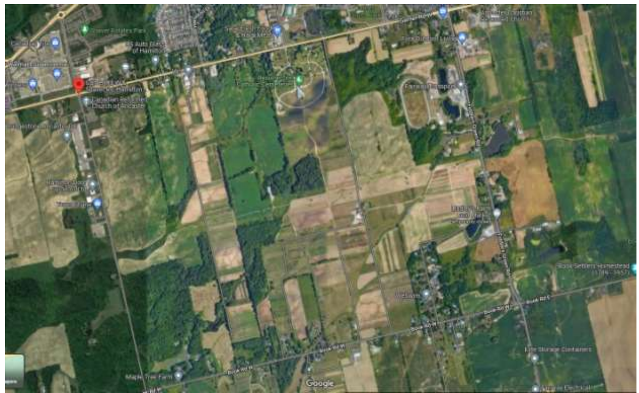
Map 9 Google map satellite view - note the many streams and seasonal watercourses (brown lines in plowed fields) crossing the area.

True, developers could take shortcuts -- much easier to do now that conservation authorities are not allowed to be consulted -- and the hapless folks who buy there can look forward to permanently running sump pumps and/or living without water damage insurance.