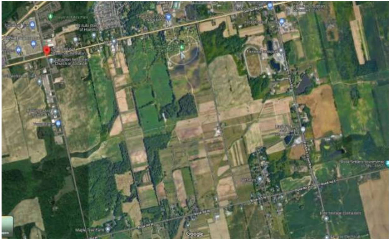
Map 9 Google map satellite view - note the many streams and seasonal watercourses (brown lines in plowed fields) crossing the area.

True, developers could take shortcuts -- much easier to do now that conservation authorities are not allowed to be consulted -- and the hapless folks who buy there can look forward to permanently running sump pumps and/or living without water damage insurance.