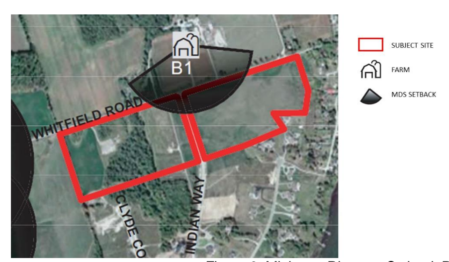
Figure 3: Minimum Distance Setback Plan

A Staff Report dated March 17, 2014 to Scugog Council (COMS-2014-05-CNC) states that "it remains the Township's position, based on the Official Plan, that the lands in question be designated for development." At its meeting on September 28, 2015, Scugog Council passed Resolution 15-482 that directed Staff to initiate discussions with Durham Region with respect to the resolution of Official Plan Deferral D5-1 provided that the benefitting property owner (Honey Heights Development Ltd.) enters into an agreement with the Township to enable the Township to recover all consulting costs related to the resolution of the Deferral.