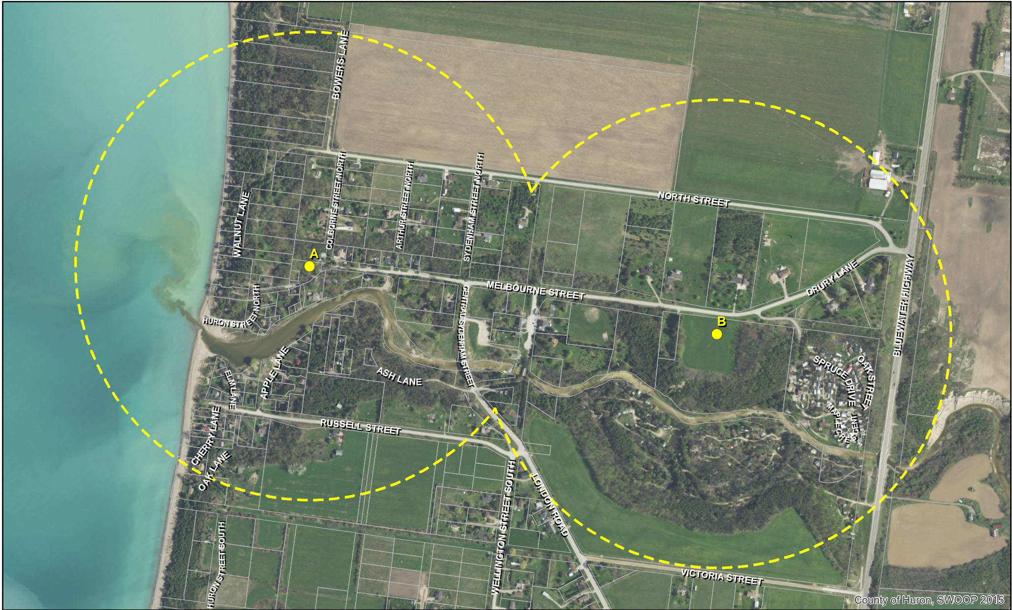
County of Huron, SWOOP 2015