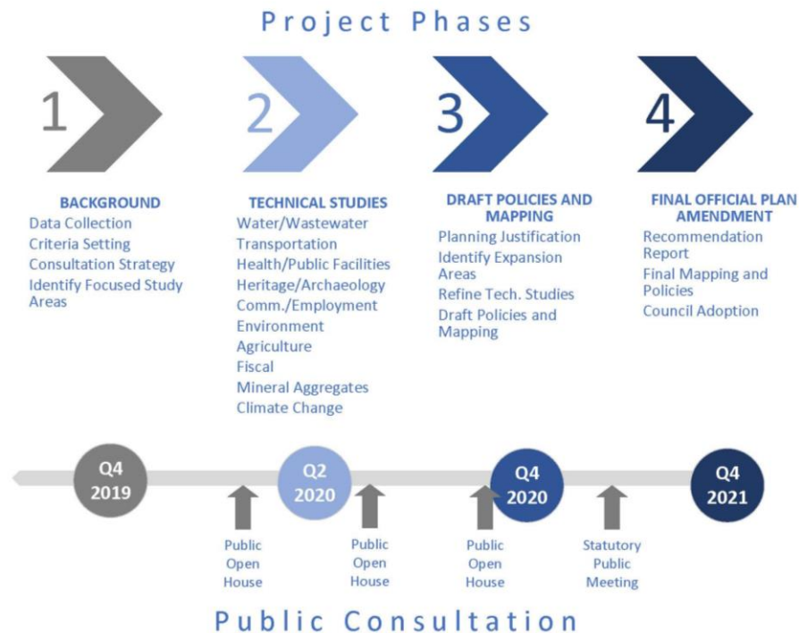
Figure 1: Settlement Area Boundary Expansion Phases and Consultation

Regional staff have been working closely with local municipal staff through preparation of the scope of the study as well as on the work undertaken to date. As the study progresses, draft materials will be provided to local municipal staff and other stakeholders through their participation on the Project Team. Broad consultation with the public and other stakeholders will be undertaken in each phase of the study.