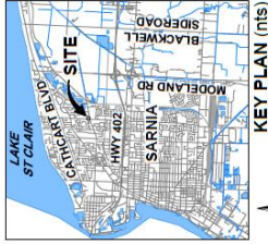
KEY PLAN (NIS)