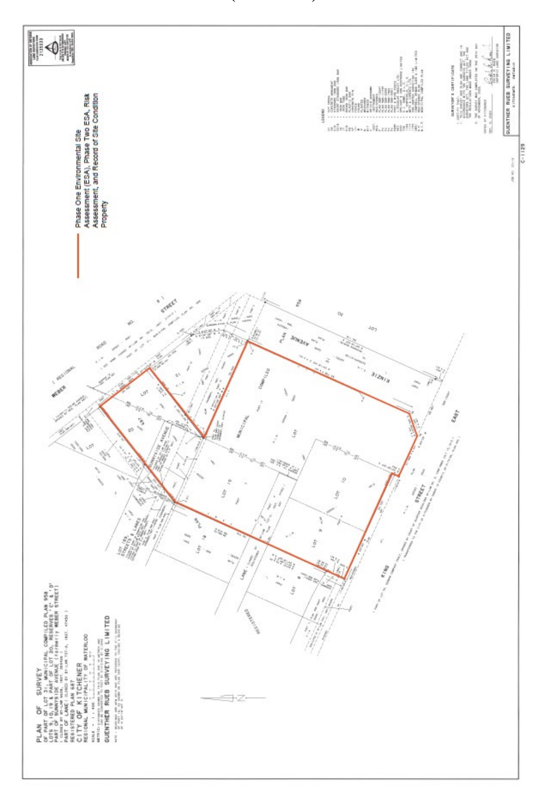
Schedule 'A': Figure 1- Site Plan (not to scale)