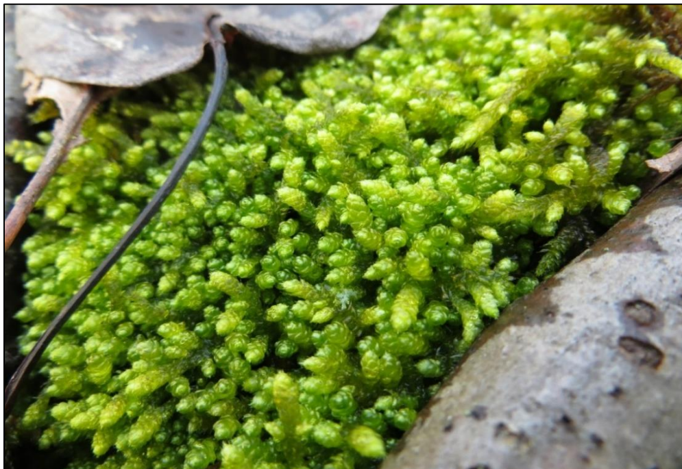
Figure 2. Spoon-leaved Moss showing brighter green colouration.