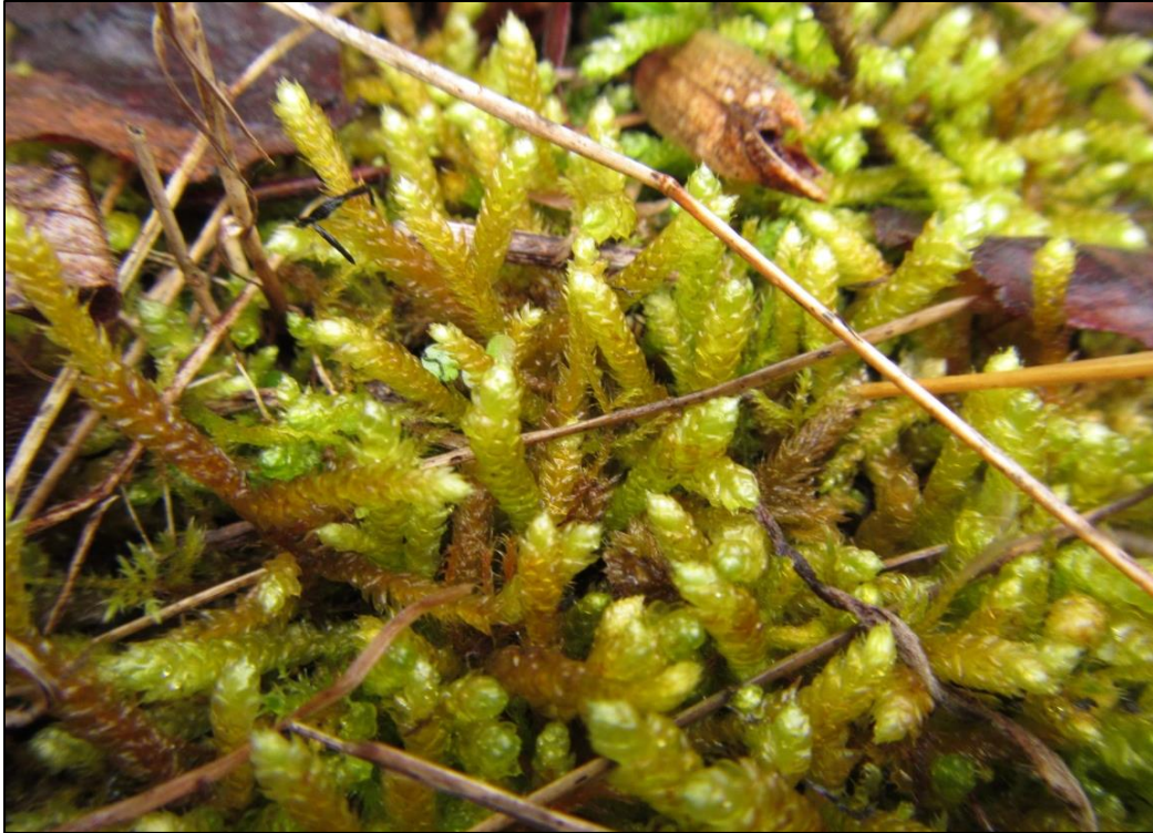
Figure 3. Spoon-leaved Moss showing yellowish-bronze colouration.