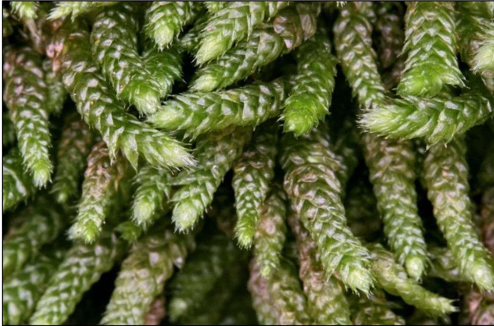
Figure 1. Spoon-leaved Moss showing olive-green colouration.

Photographs of Spoon-leaved Moss illustrating the range of colour patterns observed in Ontario colonies are shown in Figure 1 to Figure 4 below.