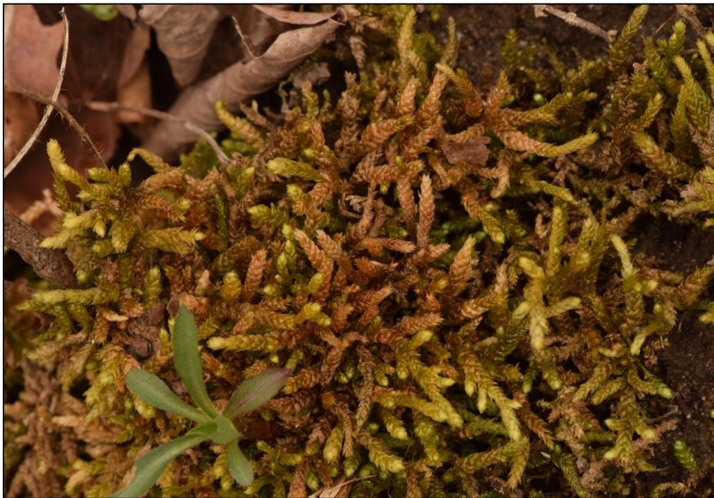
Figure 4. Spoon-leaved Moss showing brownish-bronze colouration.