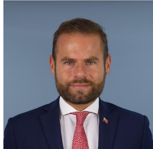
The Honourable David Piccini Minister of the Environment, Conservation and Parks