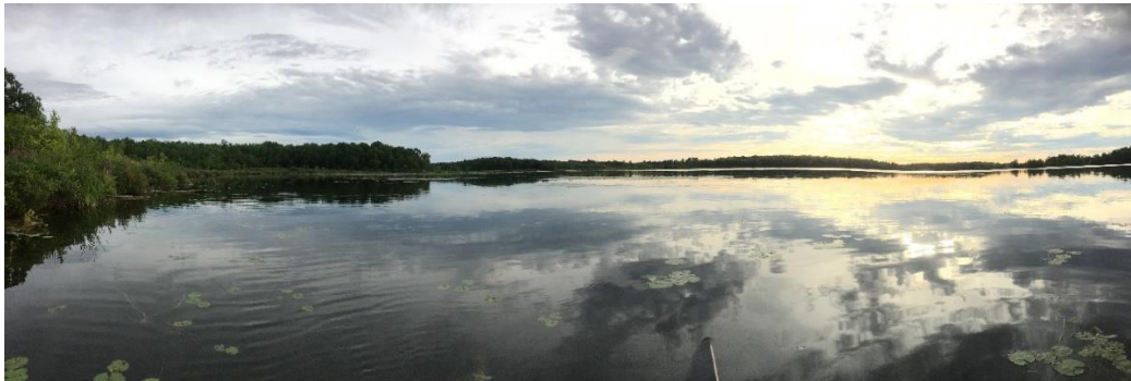
Figure 6: Trent-Severn Waterway in July 2018 following successful control of water soldier