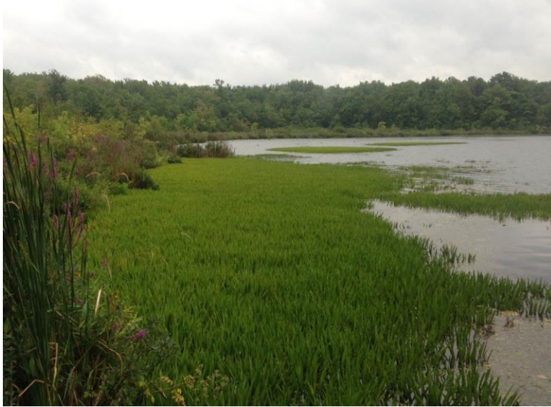
Figure 4: Water soldier infestation

The Ministry of Natural Resources and Forestry (MNRF) and partners have been monitoring water soldier within Ontario waterbodies and have taken measures to control populations and prevent spread to new locations.