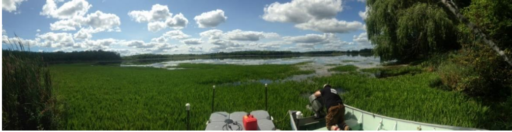
Figure 5: Water soldier infestation in Trent-Severn Waterway in August 2015 prior to control