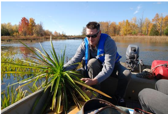
Figure 1: Water soldier

Water soldier is an invasive perennial aquatic plant that is native to Europe and northwest Asia. It has long, thin, serrated leaves that grow in a rosette formation and is similar in appearance to the top of a pineapple (Figure 1). Water soldier is submergent (i.e., grows below the water surface) for most of the year (Figure 2). It may rise to the surface of the water as new leaves mature during the summer months (Figure 3). Water soldier typically grows in shallow waters (0.5-1.5 metres) but may be able to grow in depths of up to 6 metres depending on the conditions.