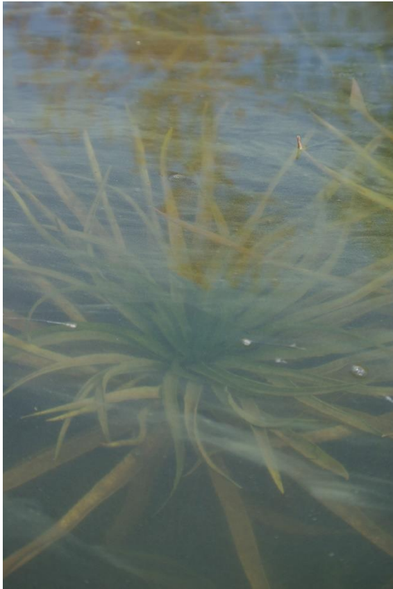
Figure 2: Submergent growth form of water soldier

Water soldier forms dense mats of vegetation (Figure 4), aggressively outcompetes native aquatic plants, and impedes recreational activities such as boating, swimming and angling. It can also interfere with infrastructure, including water intake structures, navigation canals and locks, and hydroelectric facilities, where periodic removal of entrained water soldier plants or plant parts may be required as part of ongoing facility maintenance.