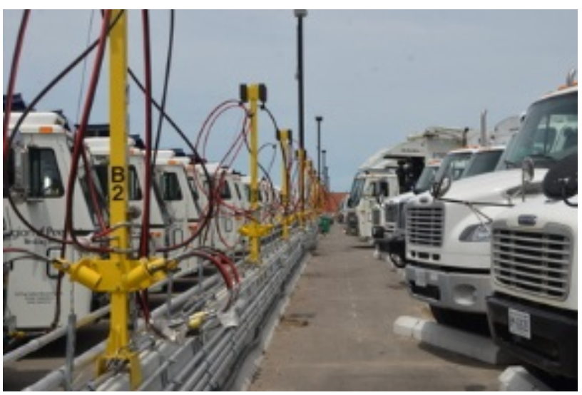
Figure 2. An Emterra compressed natural gas refuelling facility in Mississauga with many overnight slow-fill stations.

Generally, RNG is similar to conventional fossil natural gas and can be used in commercially available natural gas vehicle engines. Currently, the primary market in Canada for natural gas engines has been in transport trucks, garbage trucks, and buses. Figure 2 shows a natural gas refuelling site in Mississauga, Ontario. There are also Original Equipment Manufacturer (OEM) natural gas passenger cars and light duty trucks. After-market conversions can be installed in many diesel or gasoline engines, including off-road vehicles like agricultural or construction tractors.